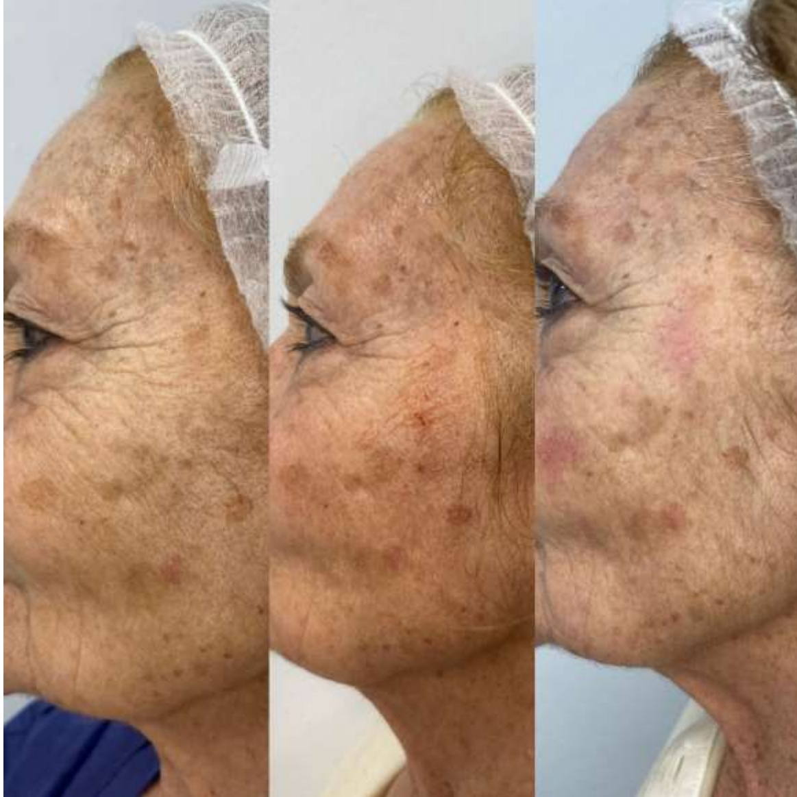
Before, immediately after 1 session and before the 3 sessions