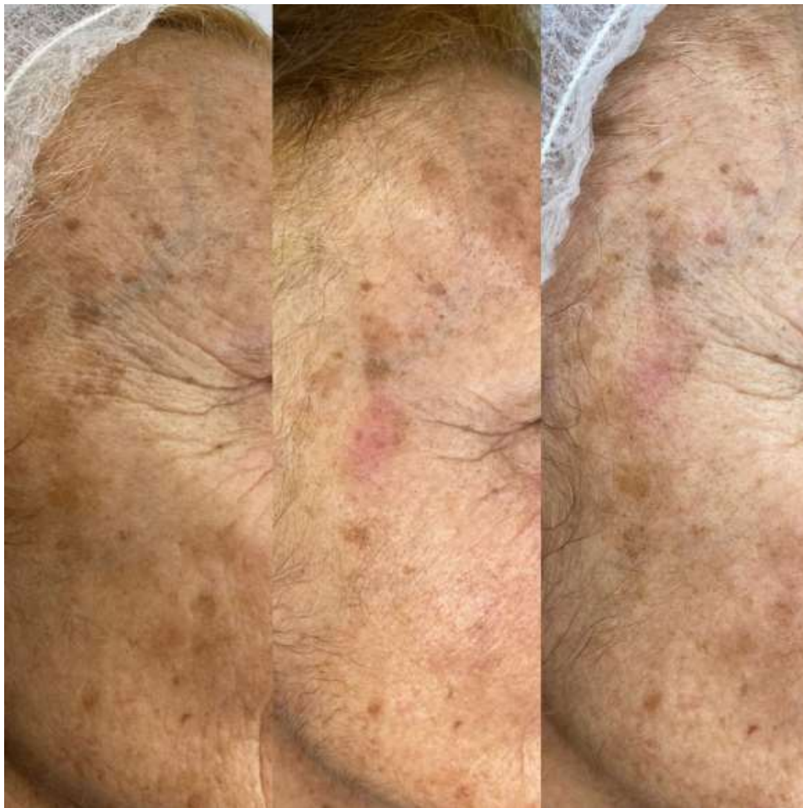
Before, immediately after 1 session and before the 3 sessions