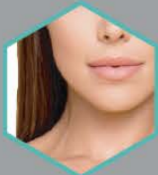
FACE / NECK